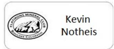
Example of a club name tag

Would you like a Flatirons Mineral Club name tag to wear at club events and field trips? The club places orders for name tags several times a year for members.