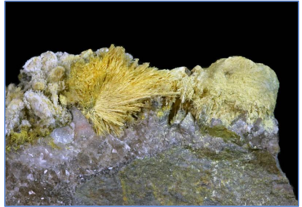
Uranophane.