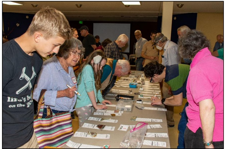
Last year's Silent Auction.

Come to the auction and find those special specimens, books, or tools that you have been looking for. We can accept cash, check, and credit cards. If you like, please bring finger food to share. Also, plan to bring something to put your purchases in and something to wrap and protect your purchases.