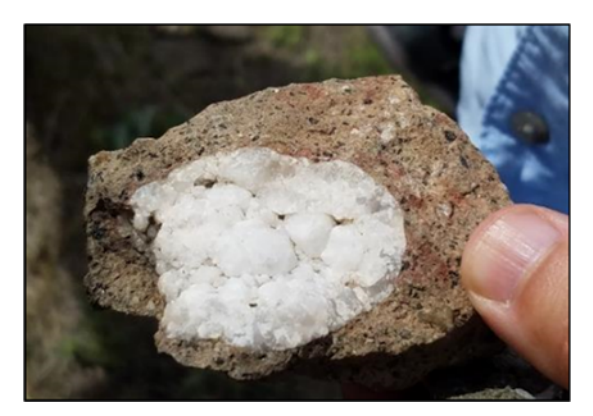
A nice cluster of analcime crystals, surrounded by thomsonite crystals from North Table Mountain

For more information about the trip and to sign up, please visit our website at <a href="https://flatironsmineralclub.org/">https://flatironsmineralclub.org/</a>, log in, and click "Field Trips."