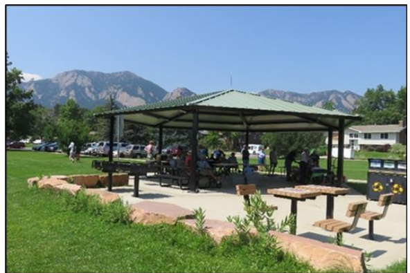
Last year's picnic.