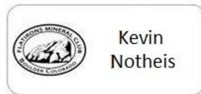
Example of a club name tag

If you would like a name tag, please log onto our website and choose the "Request a Name Tag" link in the Members Area. Add your name to the list as you want it to appear on your name tag, and it will be ordered for you. Your first name tag is free!